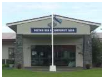
Foxton RSA & Community Assoc.